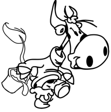
EXHIBIT REGISTRATION GUIDELINES